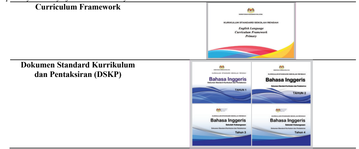
Compulsory Ministry of Education Malaysia Documents